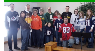
Team Jersey Sunday! What an All Star Team!