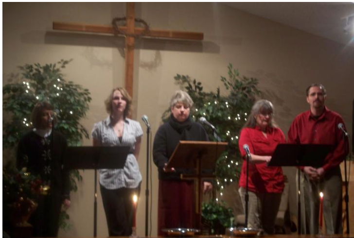
Choir/Praise Team sings a medley of Christmas Hymns